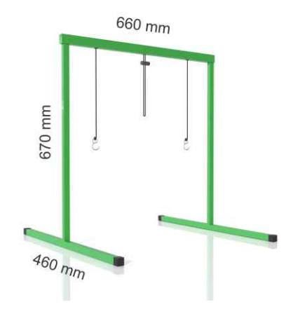
LIGHT STANDS AVAILABLE