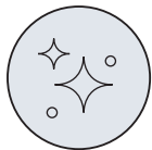
Wash & Beautify Foliage

Protect your hustle by using Athena® IPW as a leaf wash to beautify foliage. Leaf washing plants offers a range of compelling benefits that contribute to their overall health and vitality. By removing accumulated dust, pollutants, and potential contaminants from the leaves' surfaces, the plants' capacity for efficient photosynthesis increases, which is essential for optimal growth and robust yields. Cleaner leaves can also lead to better absorption of nutrients and foliar sprays, enabling the plants to access vital elements necessary for their development. Ultimately, leaf washing is a proactive and preventive measure that fosters vigorous growth and supports the cultivation of high-quality, potent flowers.