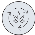
Use in all Growth Stages