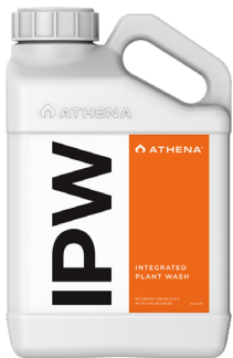
IPW Integrated Plant Wash